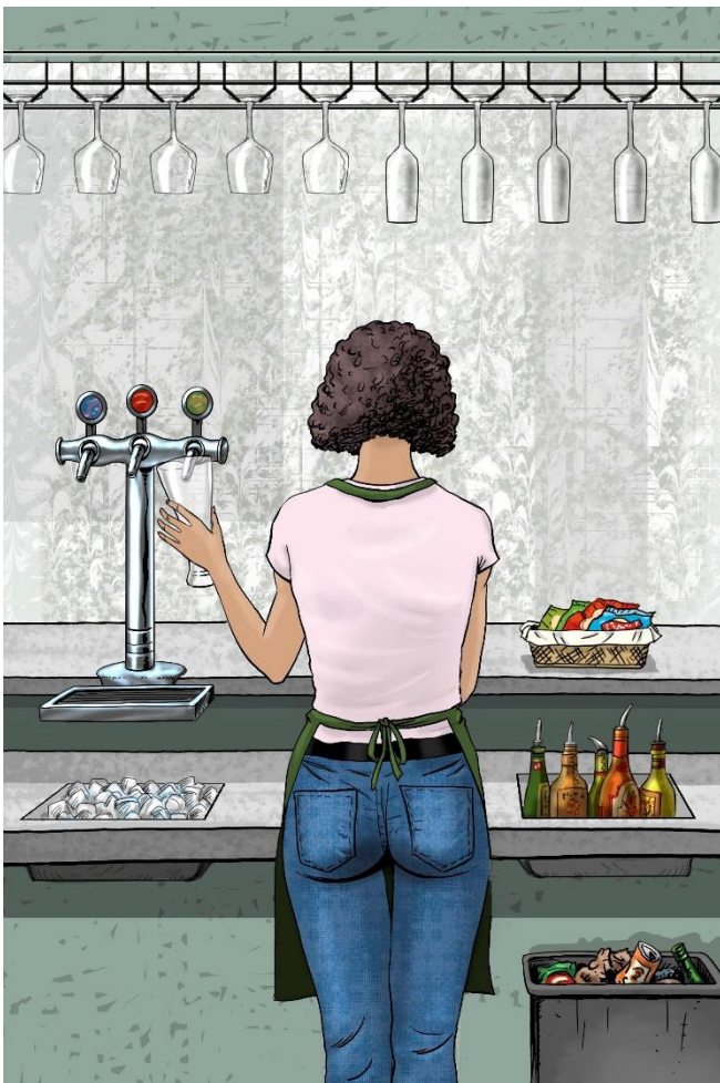
The cover graphic for the next Galahad Porter novel featuring Lucy the newly pregnant bar worker!

Just over a month into her pregnancy Lucy starts having unusual dreams. These are nothing like those she's encountered before. The description of her series of dreams was planned to start in the trilogy. When you encounter Lucy in the first book she is suffering nightmares. They add intensity to the thriller element of the story. However, at the current stage of her pregnancy the dreams are relatively simple. Nevertheless, they add an additional feeling of menace to the story. Recreating her dreams on paper is quite a challenge. I'm hoping the reader will be able to visualise the richness of them without my having to use excessive description!